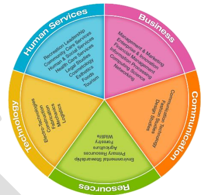
CTF Clusters and Occupational Areas

Students engaging in CTF challenges or tasks, alternate between the processes of planning , creating , appraising and communicating in non-linear manner.