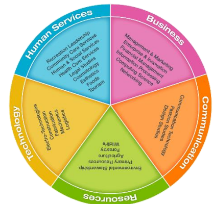
CTF Clusters and Occupational Areas

Students engaging in CTF challenges or tasks, alternate between the processes of planning , creating , appraising and communicating in non-linear manner